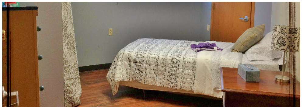
A room at our women's facility following the “Designers of Hope” transformation.