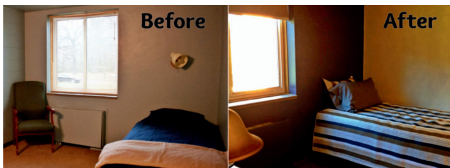
Pictured: Before and after shots of a room updated by The Home Depot

With the busy hands of our residents, the following took place: On September 9, 2016, the COTS Veterans’ and Young Adult’s building was filled with the sounds of hammering, the swish of paint brushes, and the hum of drills as volunteers from The Home Depot worked feverishly to overhaul the building.